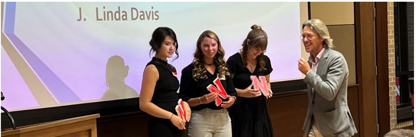
(Members of the Women's 4+ that competed at ACRA last Spring)

The team proudly traveled down the interstate in a freshly repainted red trailer, showcasing our unity and spirit. We extend our heartfelt gratitude to the alums whose unwavering support played a pivotal role in making the fall 2023 season a resounding success. Your commitment to our team has been instrumental, and we look forward to continuing this journey together.